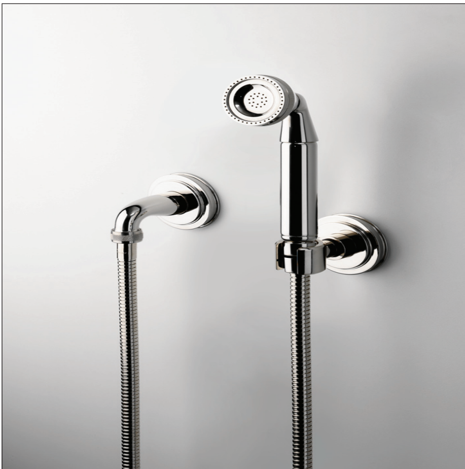
SHOWN IN Nickel

An extensive range of fittings and accessory options for the lavatory, shower, and bathtub.