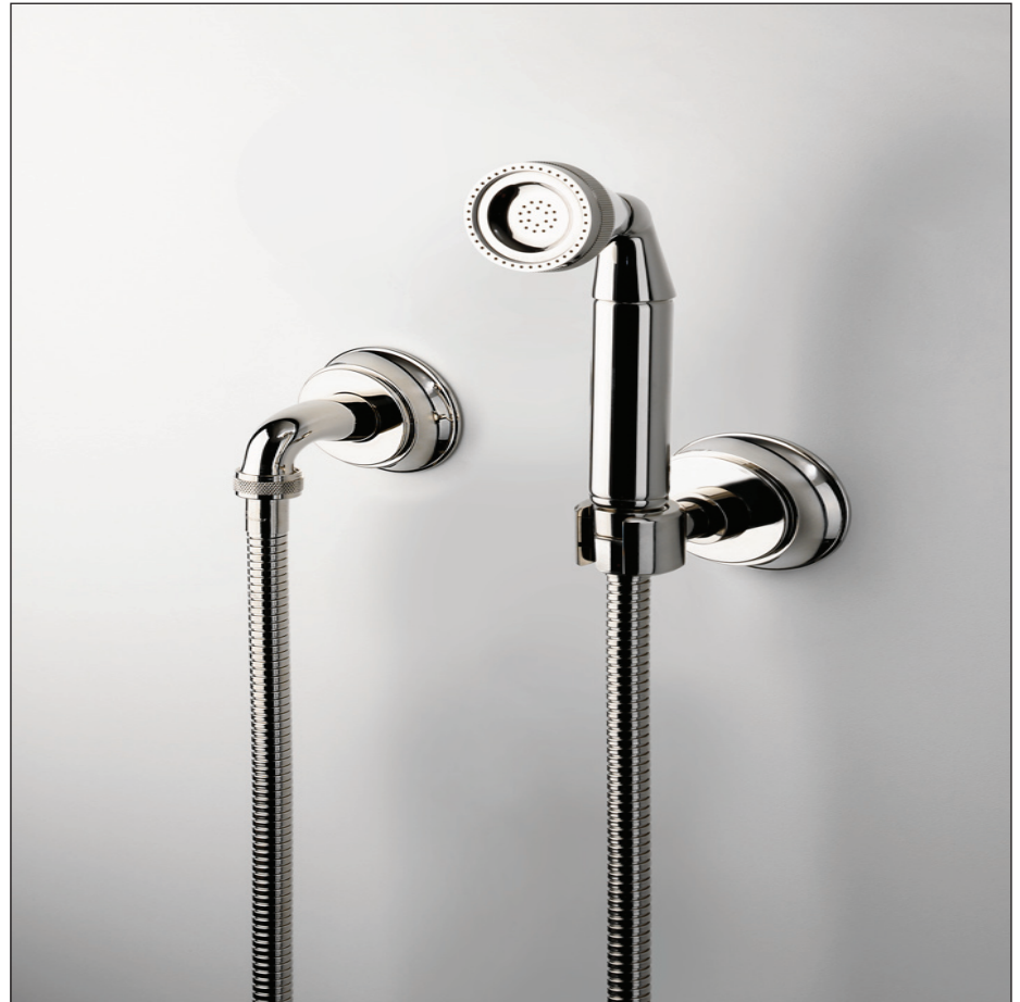
SHOWN IN Nickel

A comprehensive product line of fittings and accessories for the lavatory, shower, and bathtub.