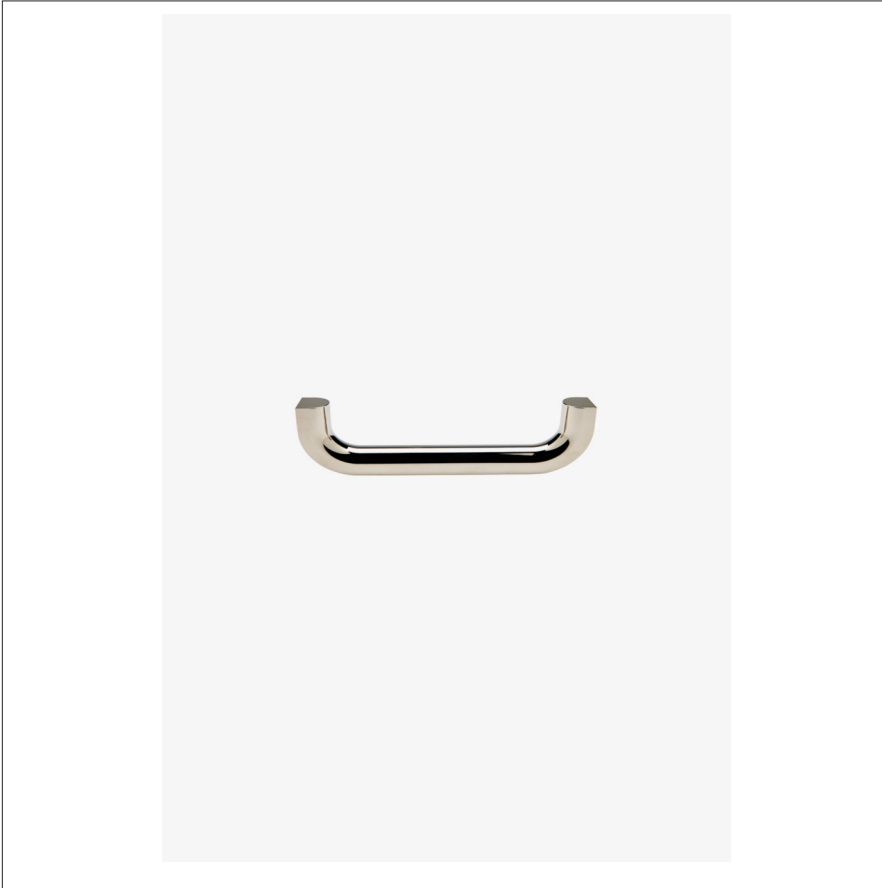
SHOWN IN DILLON 4 1/2" RECESSED PULL | DNHW01