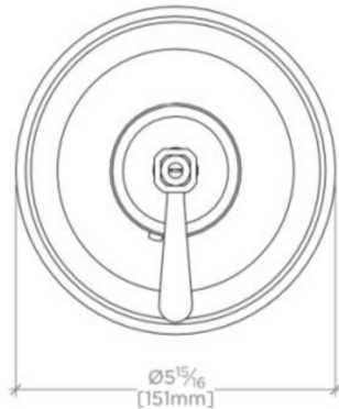
FRONT VIEW SCALE: 3"=1'-0"