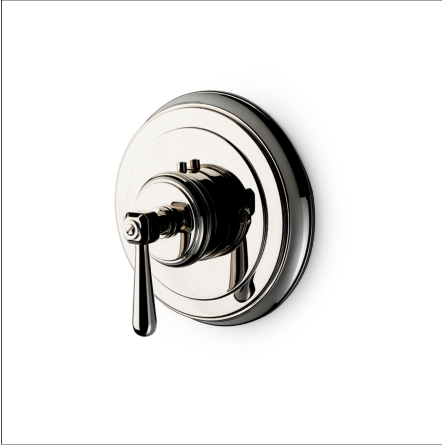
SHOWN IN NICKEL WITH LEVER HANDLE

Aero Retro Thermostatic Control Valve Trim with Metal Lever Handle