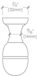
TOP VIEW SCALE: 6"=1'-0"