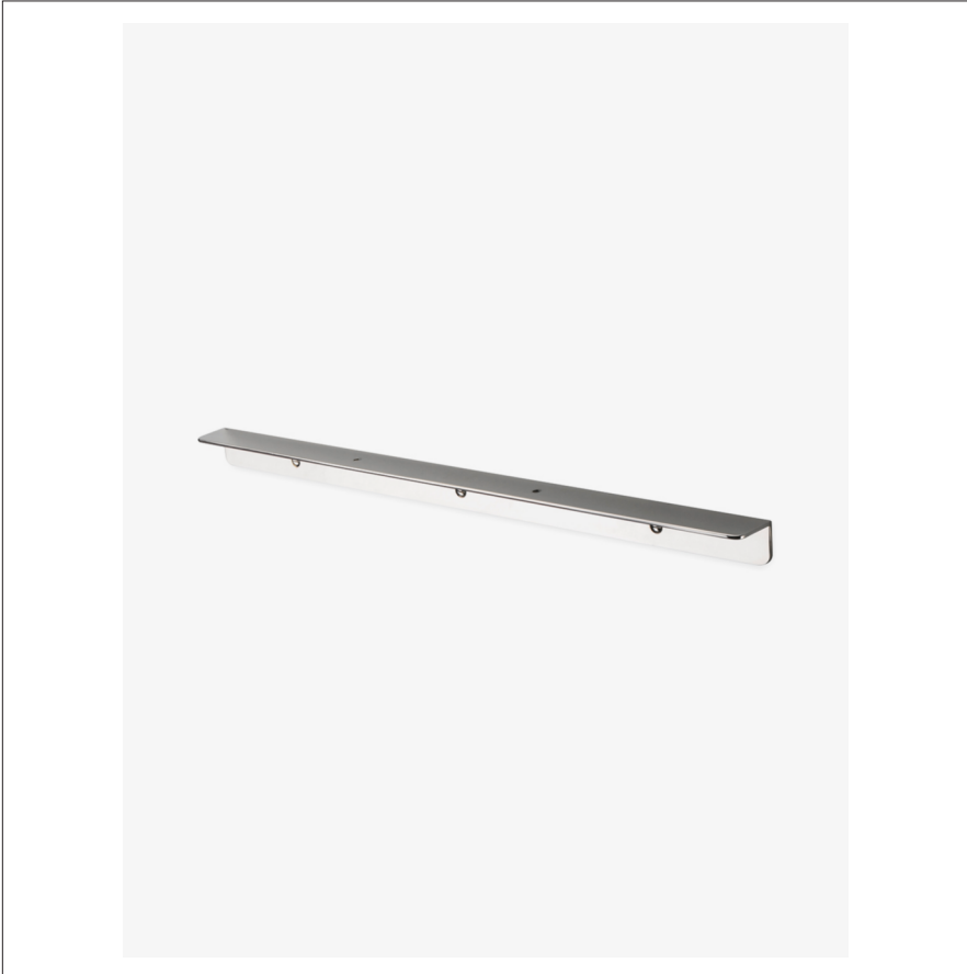
SHOWN IN UNIVERSAL SLAB SUPPORT 1 1/4" X 21" X 1 1/4" | UNSS91

Universal Slab Support 1 1/4" x 21" x 1 1/4"