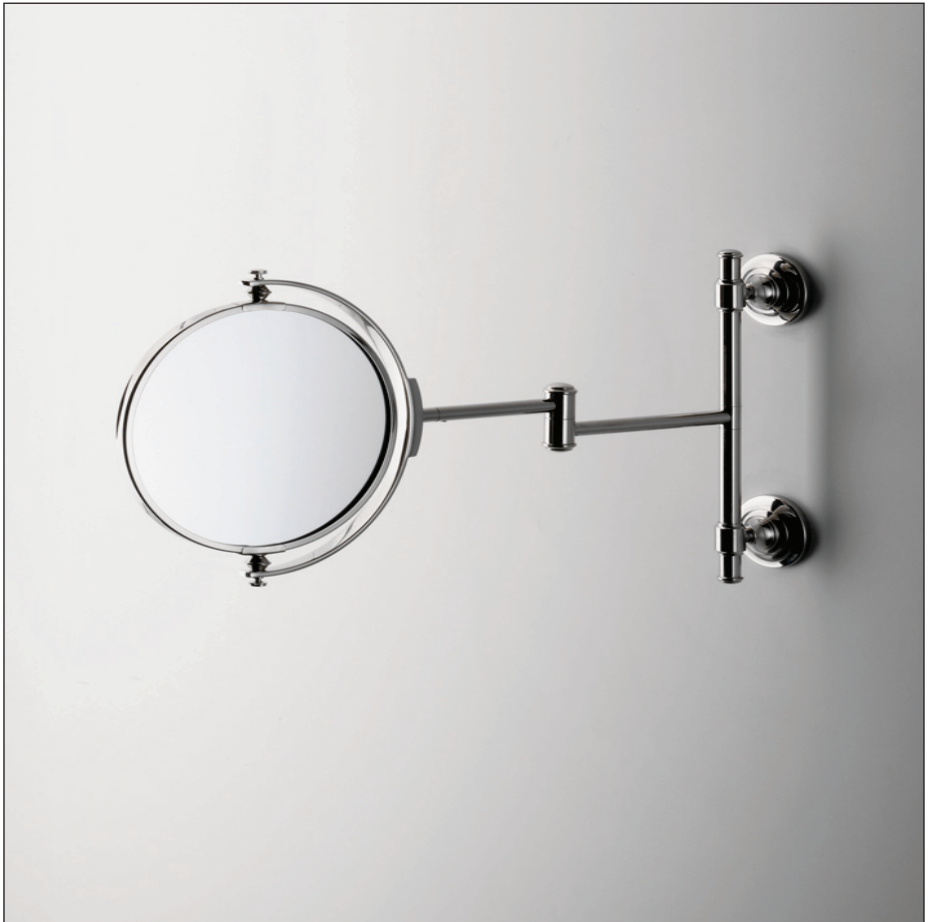
SHOWN IN Nickel

Includes paper holder, towel holders, sink caddy, hotel rack, swing arm mirror, grooming bar.