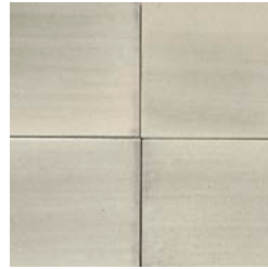
Pewter Glossy Wash V4-5