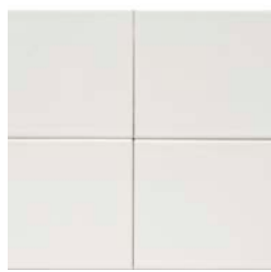
Egret Glossy Solid V2