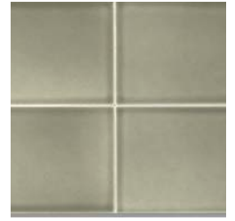
Laurel Glossy Solid V3