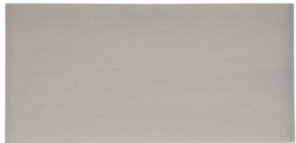
6" x 12" *