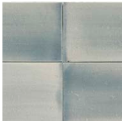
Sea Glossy Wash V4-5