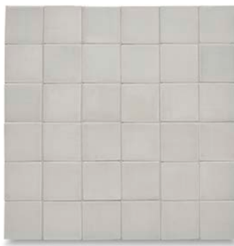
2" x 2" Stacked Mosaic