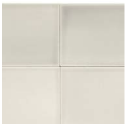
Earl Gray Glossy Solid V3