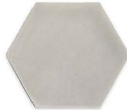
3" Hexagon **