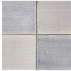
Indigo Glossy Wash V4-5