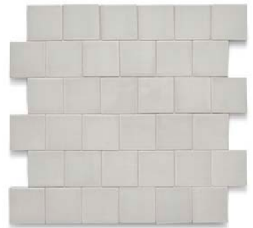
2" x 2" Staggered Mosaic