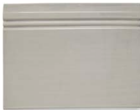
Everett Base 4 3/4" x 6"