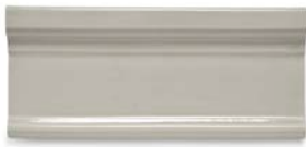
Belmont Rail 3" x 6"