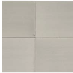
Nickel Glossy Wash V4-5