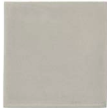
3" x 3" **