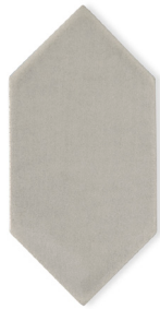
2" x 4 1/4" Picket **