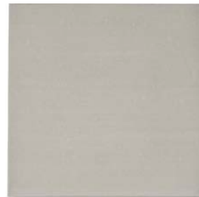
6" x 6" *