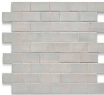
1 1/4" x 2 3/8" Staggered Mosaic