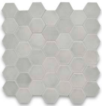
2" Hexagon Mosaic