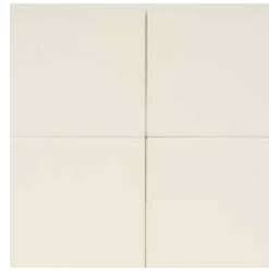
Talc Glossy Solid V2