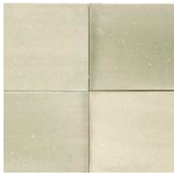
Sage Glossy Wash V4-5