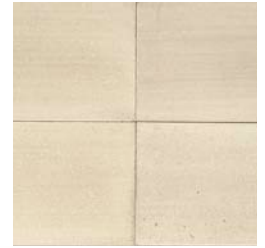
Cocoa Glossy Wash V4-5