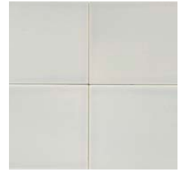
Water Glossy Solid V3