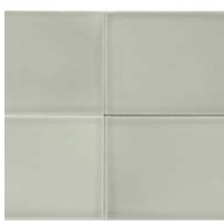
Seaglass Glossy Solid V3