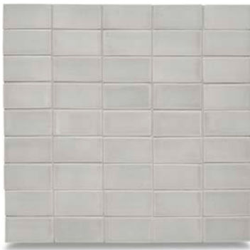
1 1/4" x 2 3/8" Stacked Mosaic