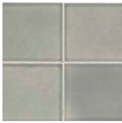
Flannel Glossy Solid V3