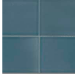
Marine Glossy Solid V3