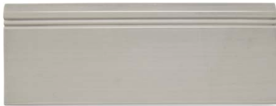
Everett Base 4 3/4" x 12"