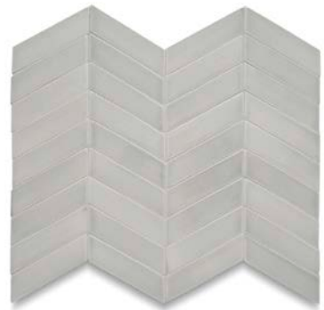
1" x 4" Chevron Mosaic