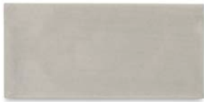
2" x 4 1/4" **