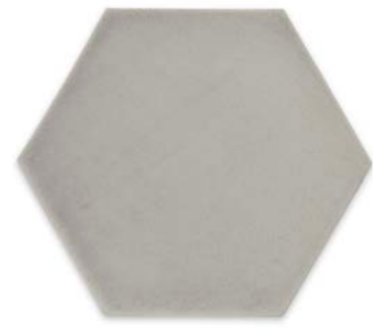
4 1/4" Hexagon **