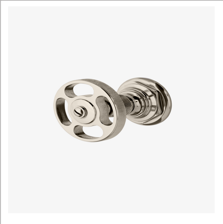
SHOWN IN R.W. ATLAS VOLUME CONTROL VALVE TRIM WITH METAL WHEEL HANDLE| RWVC01