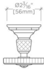
TOP VIEW SCALE: 3"=1'-0"