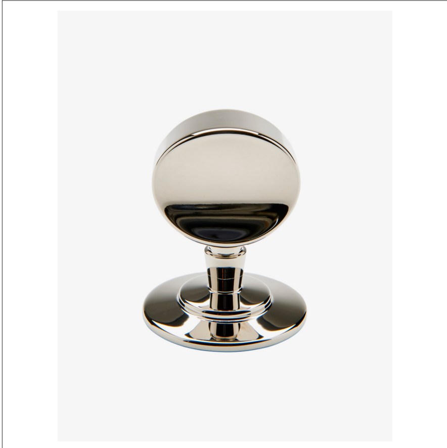
SHOWN IN CHORD 1 1/4" KNOB|CKHW01