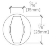
FRONT VIEW SCALE: 6"=1'-0"