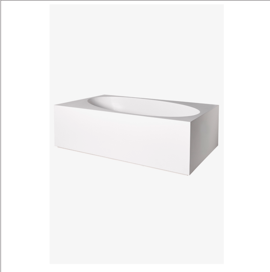
SHOWN IN FORMWORK 66" X 40" X 24" LITHIC FREESTANDING OR ALCOVE BOX BATHTUB WITH RIGHT DRAIN| FMBT6R

Formwork 66" x 40" x 24" Lithic Freestanding or Alcove Box Bathtub with Left Drain