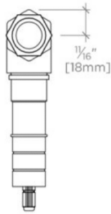
TOP VIEW SCALE: 3"=1'-0"