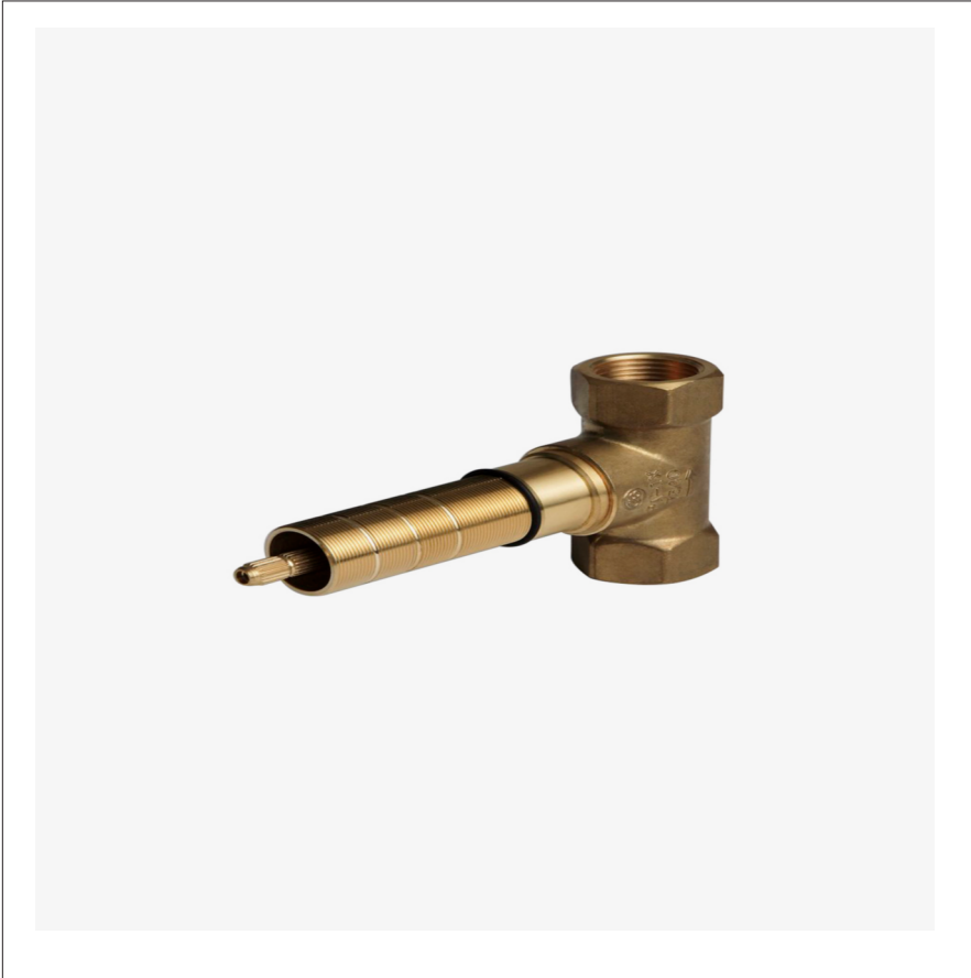
SHOWN IN UNIVERSAL 3/4" CLOCKWISE OPEN VOLUME CONTROL VALVE| GUVc17

Universal 3/4" Clockwise Open Volume Control Valve