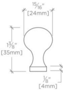
SIDE VIEW SCALE: 6"=1'-0"