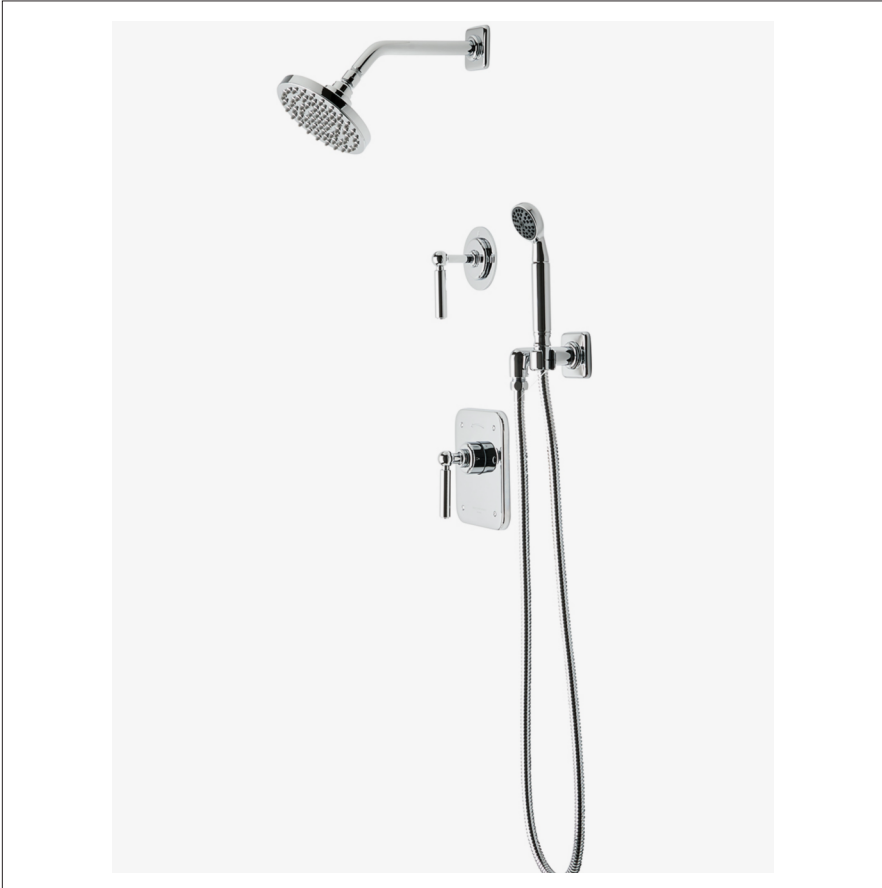
SHOWN IN LUDLOW PRESSURE BALANCE SHOWER PACKAGE WITH 6" RAIN SHOWER HEAD, HANDSHOWER AND DIVERTER

Ludlow Pressure Balance Shower Package with 6" Rain Shower Head, Handshower and Diverter Lever Handle