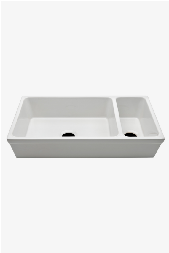
SHOWN IN CLAYBURN 35 1/2" X 19 3/4" X 10" DOUBLE FIRECLAY FARMHOUSE APRON KITCHEN SINK WITH CENTER

Clayburn 35 1/2" x 19 3/4" x 10" Double Fireclay Farmhouse Apron Kitchen Sink with Center Drains