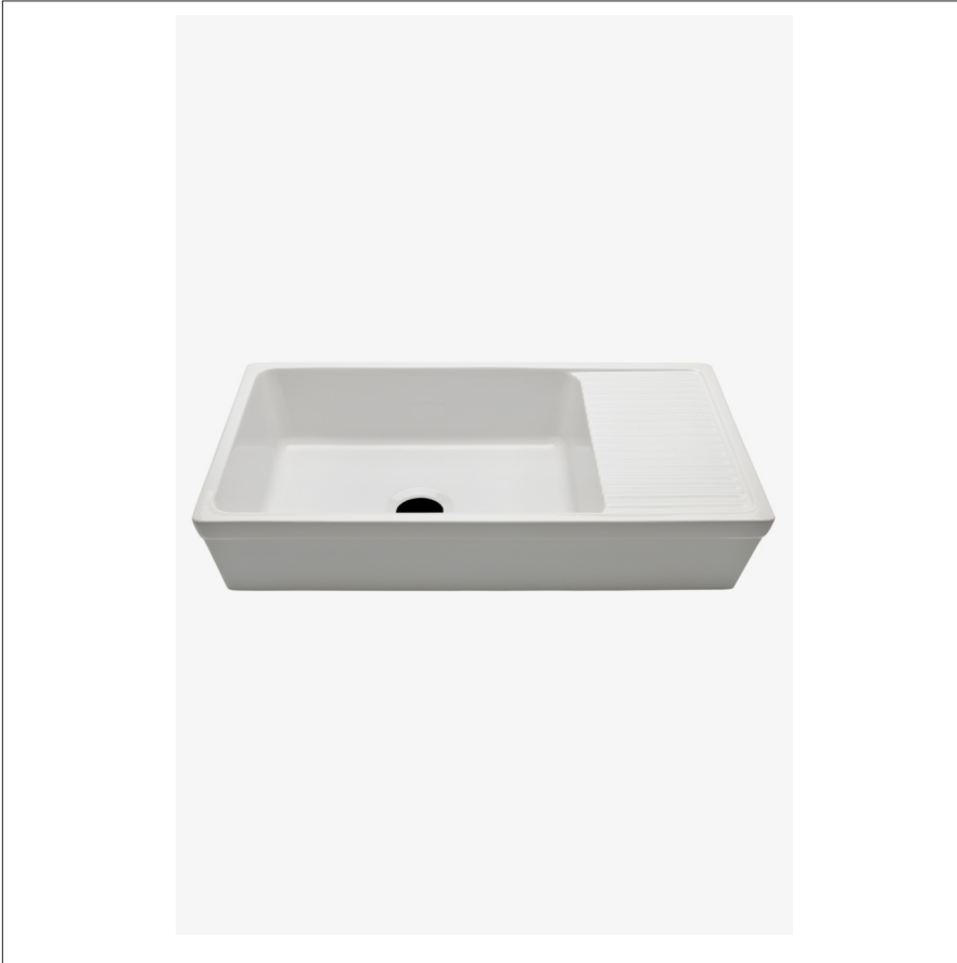
SHOWN IN CLAYBURN 35 1/2" X 19 3/4" X 10" FIRECLAY FARMHOUSE APRON KITCHEN SINK WITH CENTER DRAIN AND

Clayburn 35 1/2" x 19 3/4" x 10" Fireclay Farmhouse Apron Kitchen Sink with Center Drain and Drainboard