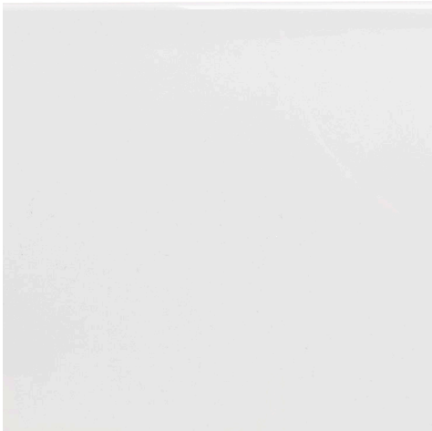
WHITE GLOSSY SOLID V1 Δ