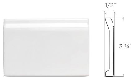
STANDARD BASE 3 3/4" X 6"