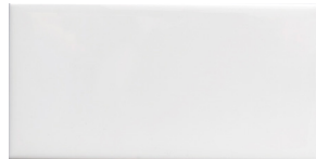
FIELD TILE 3" X 6"