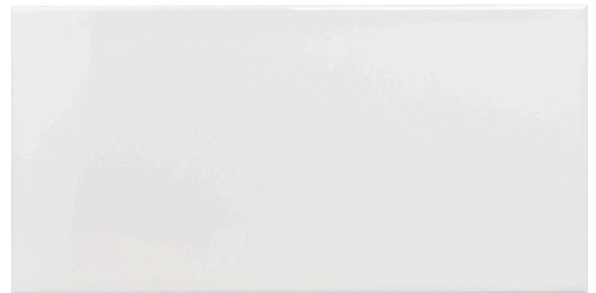
FIELD TILE 6" X 12"*