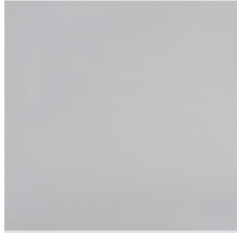
CINDER GLOSSY SOLID V2 Δ