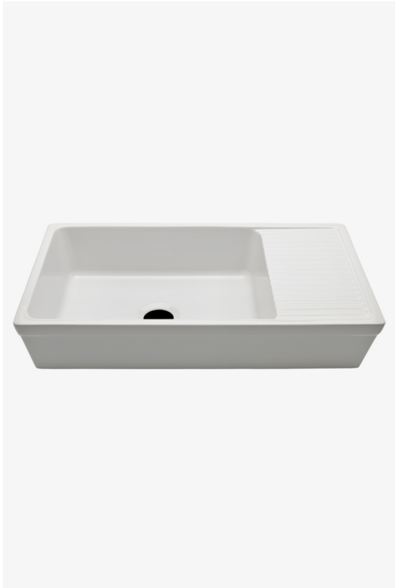
SHOWN IN CLAYBURN 35 1/2" X 19 3/4" X 10" FIRECLAY FARMHOUSE APRON KITCHEN SINK WITH CENTER DRAIN AND

Clayburn 35 1/2" x 19 3/4" x 10" Fireclay Farmhouse Apron Kitchen Sink with Center Drain and Drainboard