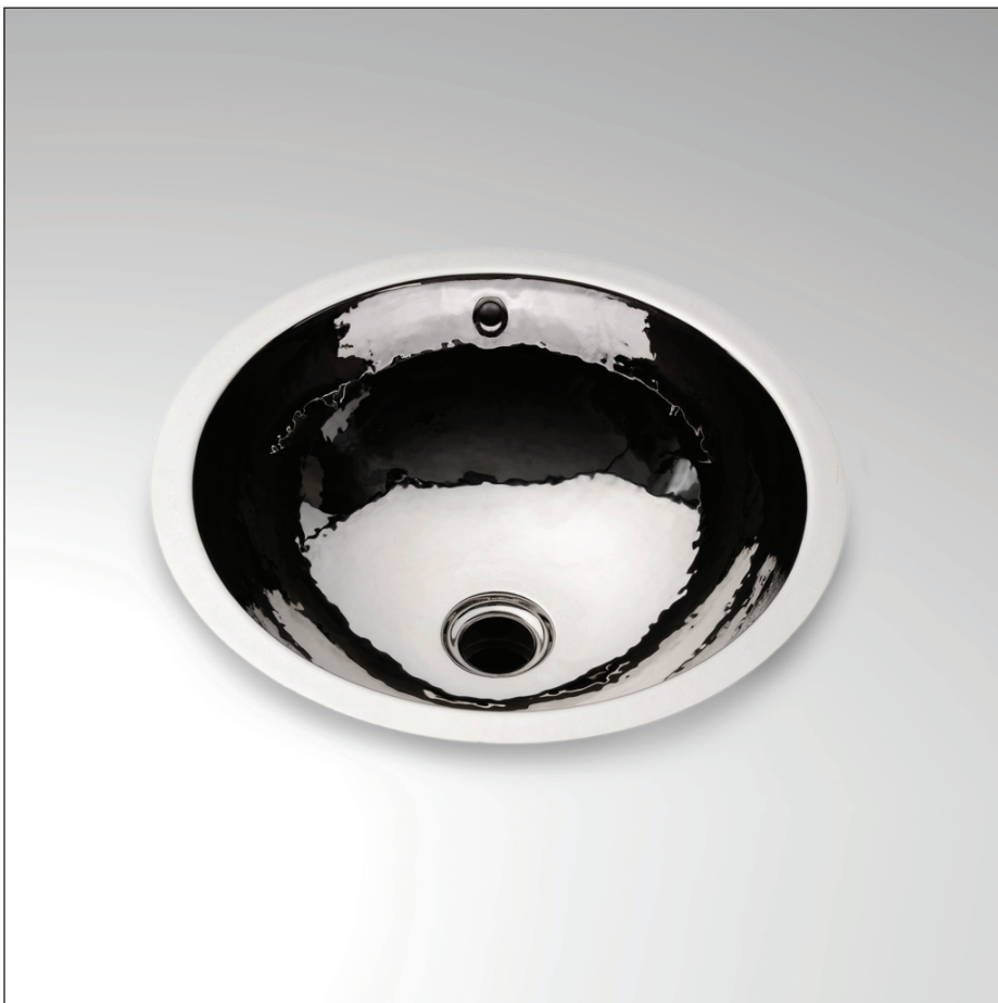
SHOWN IN finish/color

Suitable for master baths and powder rooms.