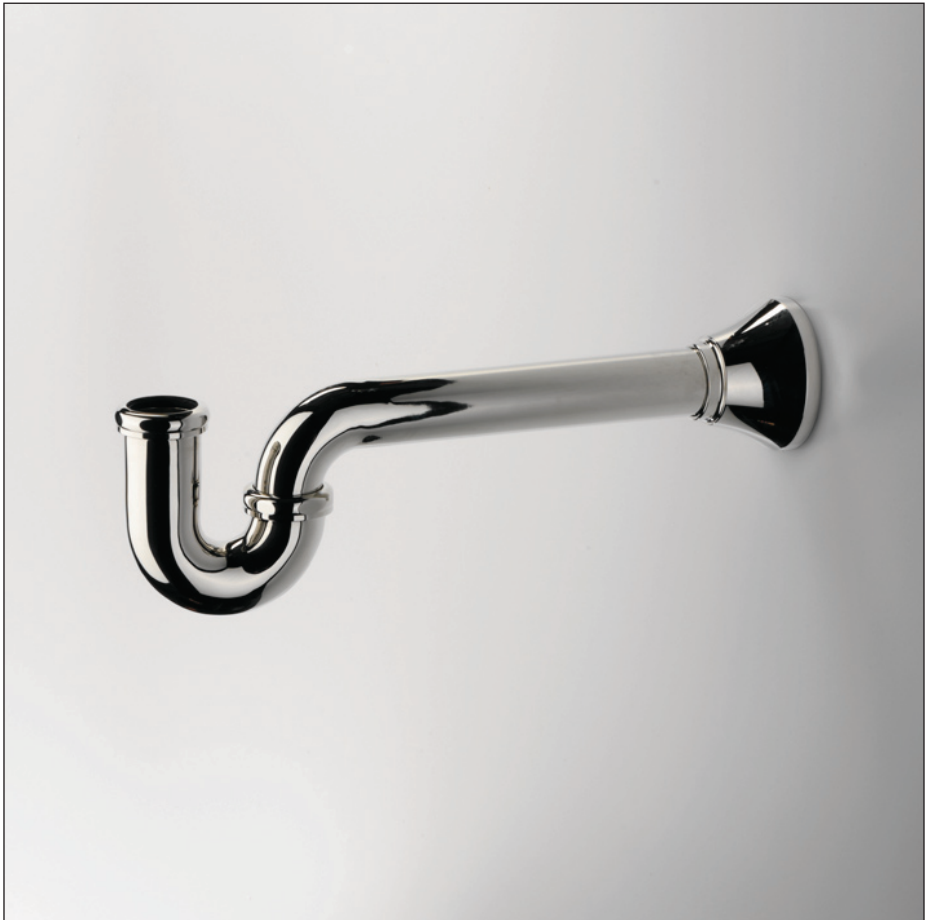
SHOWN IN Nickel