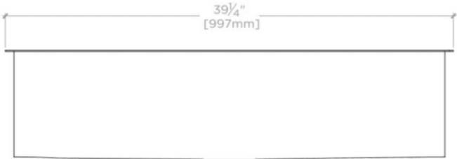
FRONT VIEW SCALE: 1"=1'-0"