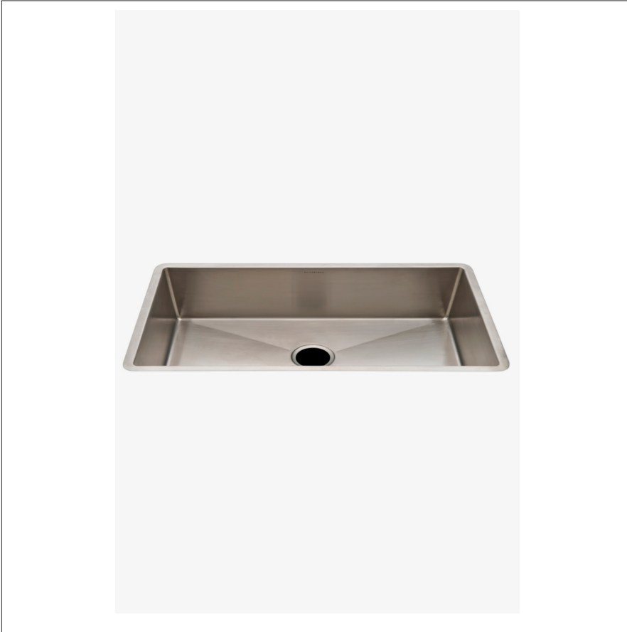
SHOWN IN KERR 39 1/4" X 18 3/4" X 10" STAINLESS STEEL KITCHEN SINK WITH CENTER DRAIN| KRSK16

Kerr 39 1/4" x 18 3/4" x 10" Stainless Steel Kitchen Sink with Center Drain