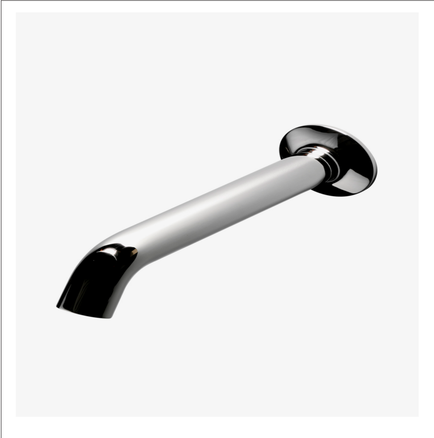
SHOWN IN .25 WALL MOUNTED TUB SPOUT| PTTS82