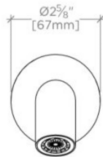
FRONT VIEW SCALE: 3"=1'-0"