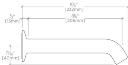
SIDE VIEW SCALE: 3"=1'-0"