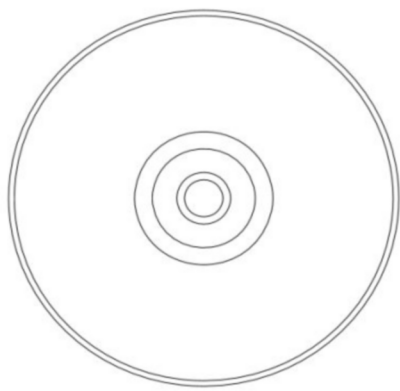
TOP VIEW SCALE: 3"=1'-0"

Etoile Wall or Ceiling Mounted 8" Shower Rose