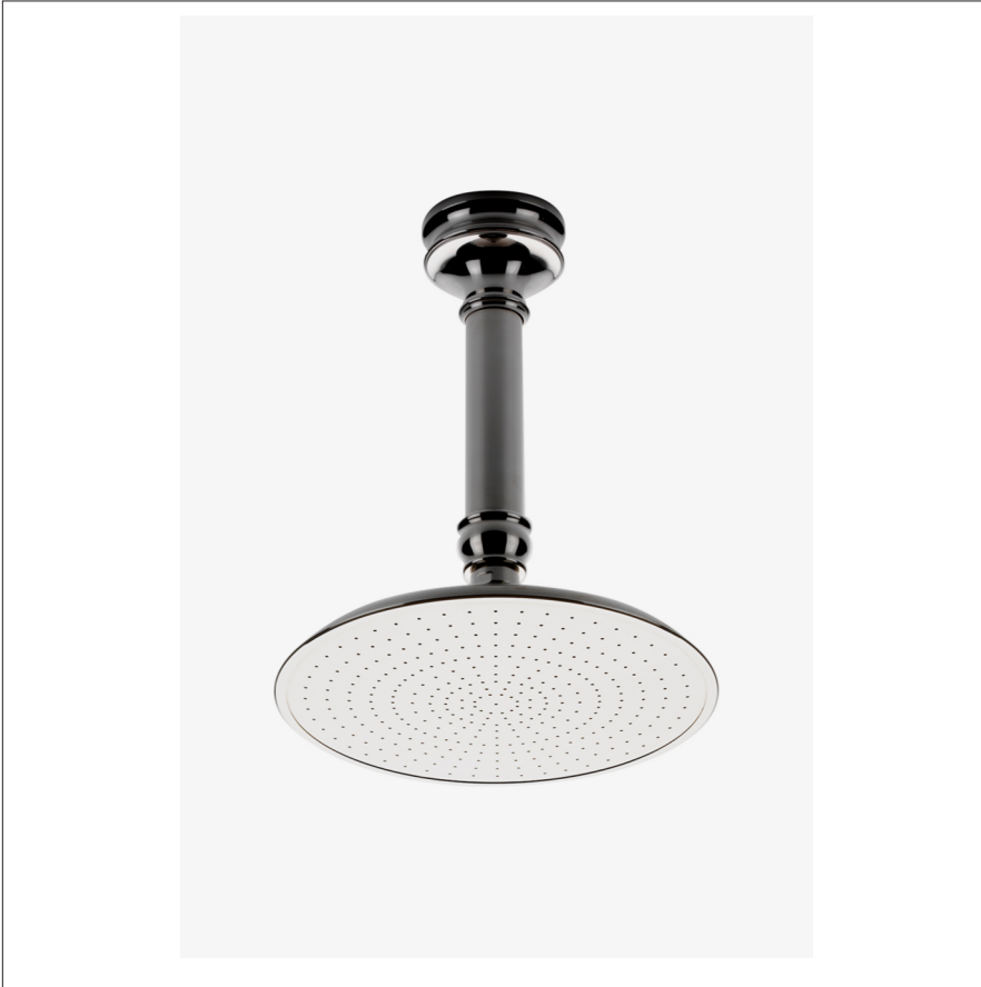
SHOWN IN ETOILE WALL OR CEILING MOUNTED 8" SHOWER ROSE | ETSH18