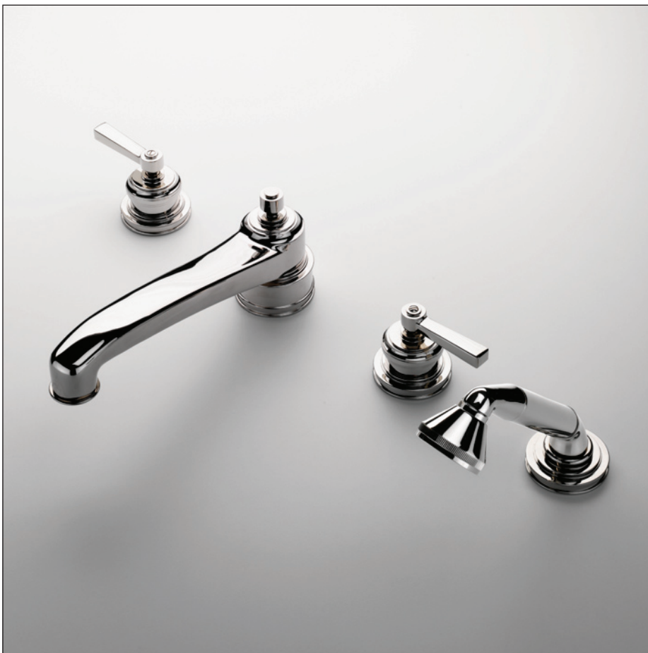
SHOWN IN Nickel

An extensive range of fittings and accessory options for the lavatory, shower, and bathtub.