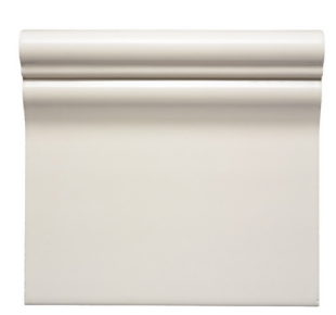
PARK AVE B BASE 4 <sup>7</sup>/<sub>8</sub>" X 6"