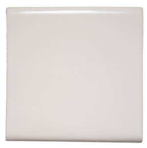
FIELD TILE 6" X 6"