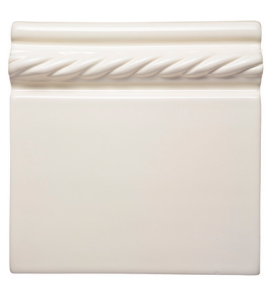
ROPE AND STAR BASE 6" X 6"