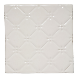
DECORATIVE EMBOSSED 6" X 6"