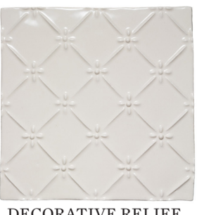
DECORATIVE RELIEF 6" X 6"