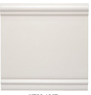
5TH AVE. STANDARD BASE 6" X 6"