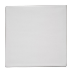
WHITE (MATTE SOLID)