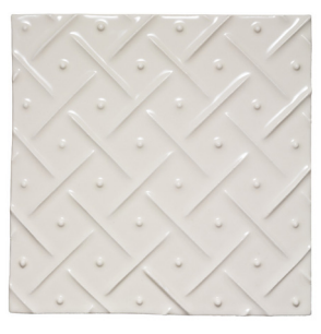
BAR AND DOT 6" X 6"