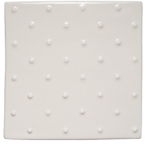
SWISS DOT "B" 6" X 6"