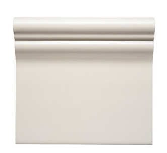
PARK AVE B BASE 4\frac{7}{8} " X 6"