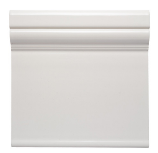
LEXINGTON AVE. "B" BASE 6" X 6"