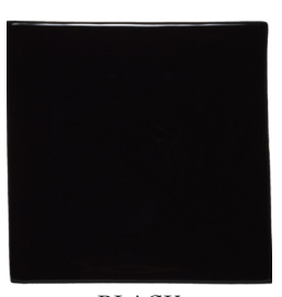
BLACK (GLOSSY SOLID)