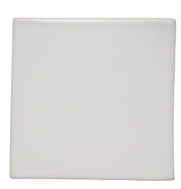
NATURAL (GLOSSY SOLID)