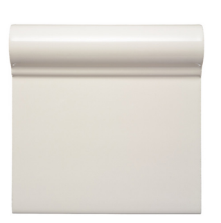
COLUMBUS AVE. STANDARD BASE 6" X 6"