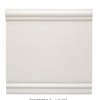
FIFTH AVE. STANDARD BASE 6" X 6"