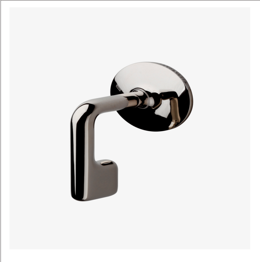
SHOWN IN .25 VOLUME CONTROL VALVE TRIM WITH METAL LEVER HANDLE| PTVC48

.25 Volume Control Valve Trim with Metal Lever Handle