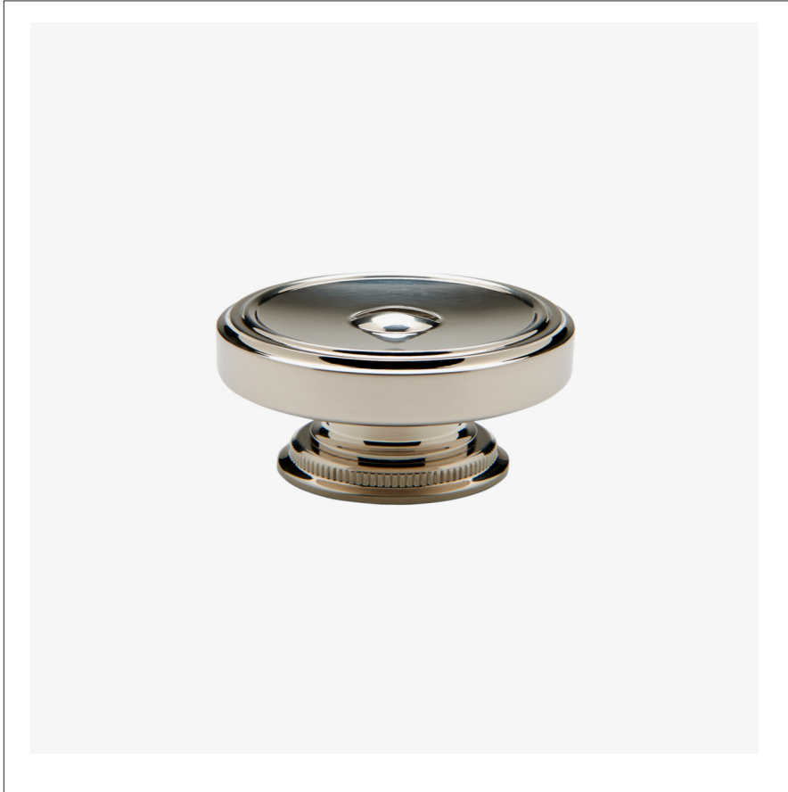
SHOWN IN R.W. ATLAS 1 5/8" ROSETTE KNOB | RWHW11