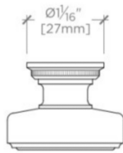
TOP VIEW SCALE: 6"=1'-0"