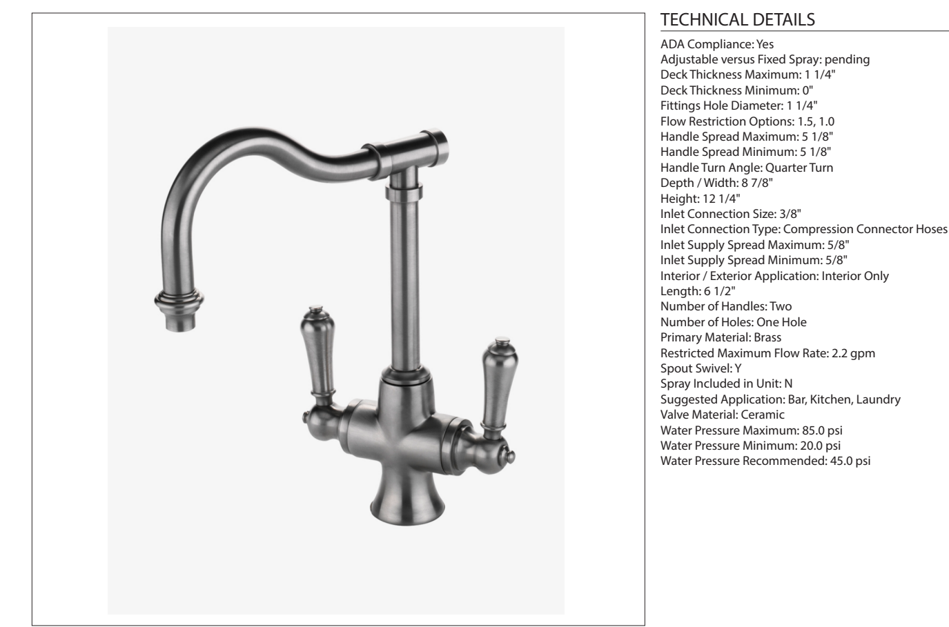
SHOWN IN MEDOC ONE HOLE HIGH PROFILE KITCHEN FAUCET, METAL LEVER HANDLES | MEKM42