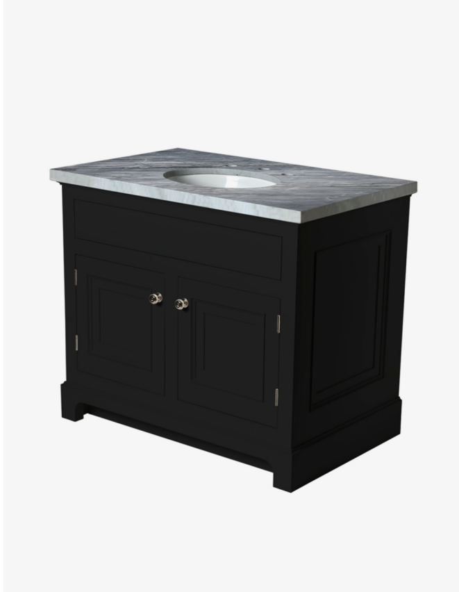
SHOWN IN BELDEN SINGLE VANITY PACKAGED WITH SINK AND SLAB TOP 38" X 24 1/2" X 31 1/2" BEVN02

Belden Single Vanity Packaged with Sink and Slab Top 38" x 24 1/2" x 31 1/2"