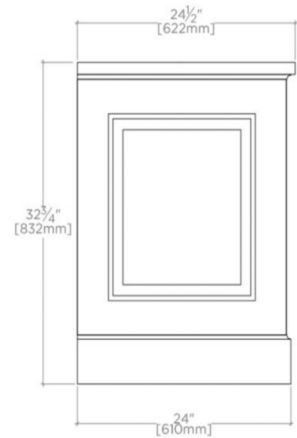
SIDE VIEW SCALE: 3/4"=1'-0"