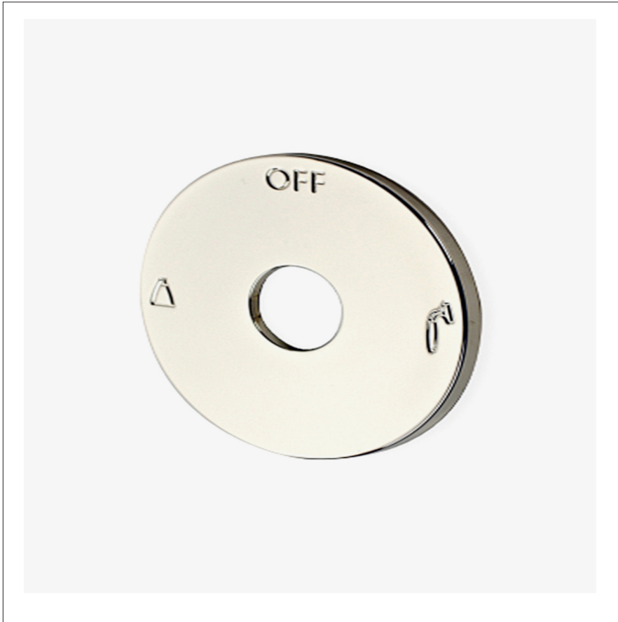
SHOWN IN UNIVERSAL TWO WAY THERMOSTATIC DIVERTER VALVE TRIM (PLATE ONLY)| UNDV01