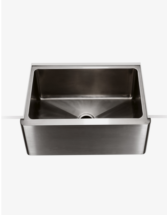
SHOWN IN KERR 24" X 18" X 9" STAINLESS STEEL FARMHOUSE APRON KITCHEN SINK WITH CENTER DRAIN| KRSK70