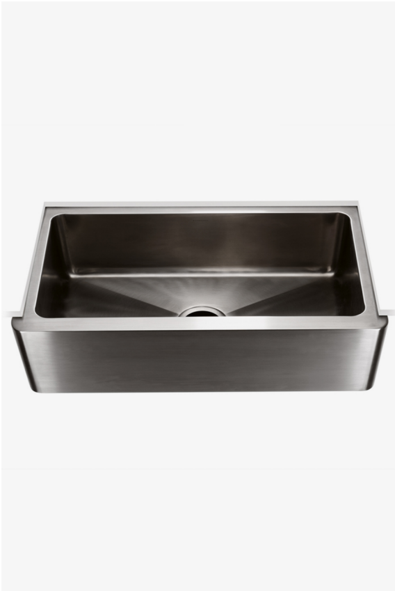
SHOWN IN KERR 30" X 18" X 10 1/8" STAINLESS STEEL FARMHOUSE APRON KITCHEN SINK WITH CENTER DRAIN| KRSK72

Kerr 30" x 18" x 10 1/8" Stainless Steel Farmhouse Apron Kitchen Sink with Center Drain