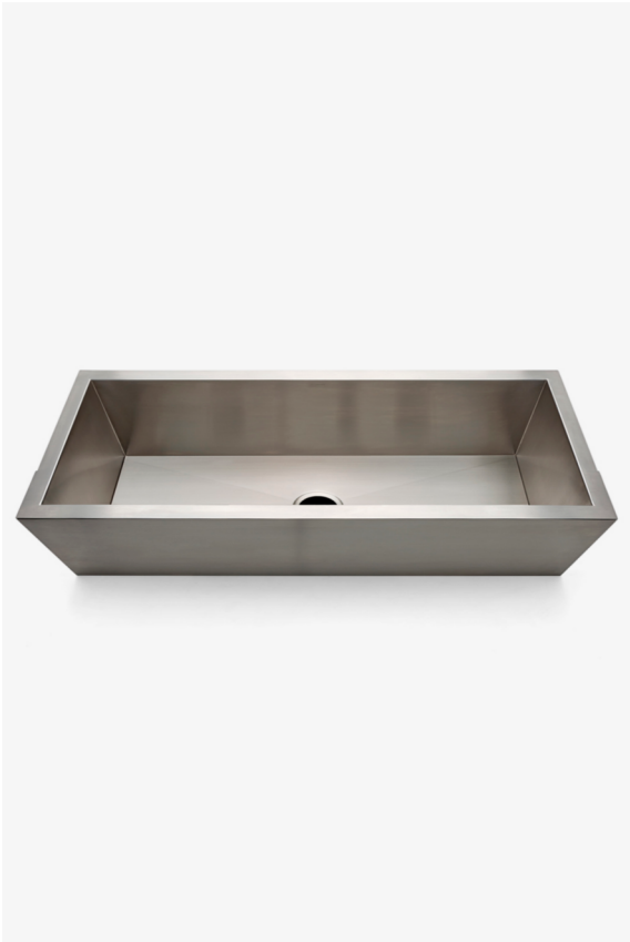
SHOWN IN KERR 42" X 21" X 15" STAINLESS STEEL RANCHHOUSE APRON KITCHEN SINK WITH CENTER DRAIN| KRSK74

Kerr 42" x 21" x 15" Stainless Steel Ranchhouse Apron Kitchen Sink with Center Drain