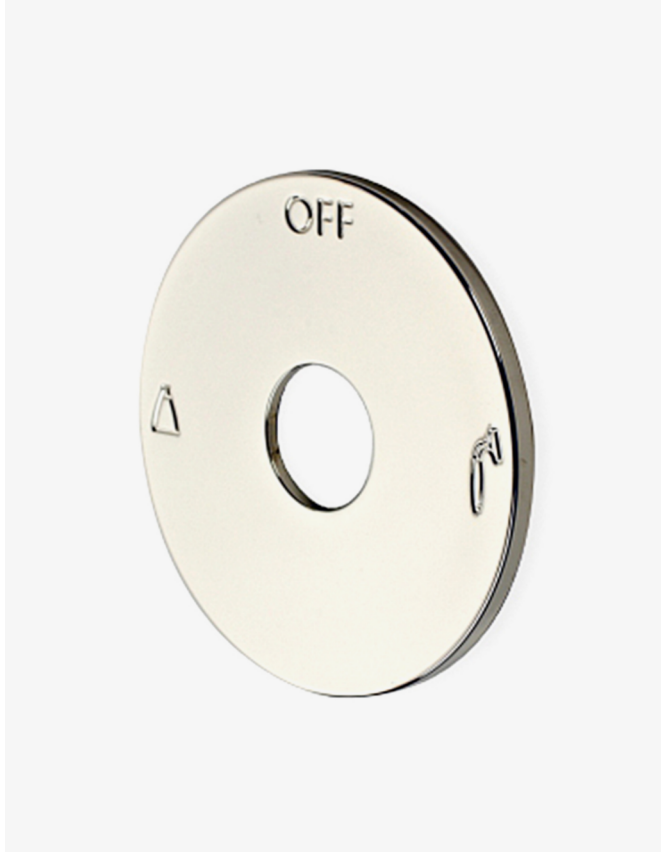
SHOWN IN NICKEL

Universal Two Way Thermostatic Diverter Valve Trim (Plate Only)