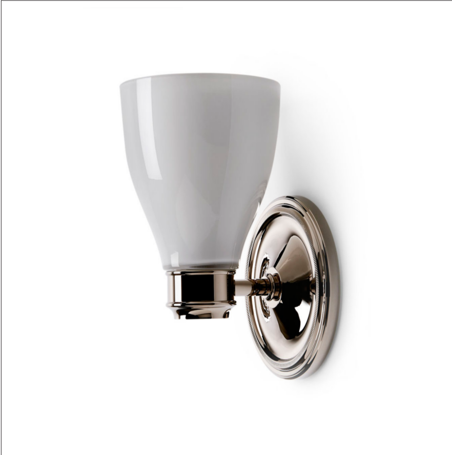
SHOWN IN NICKEL WITH OPAL SHADE

Cole Wall Mounted Single Arm Sconce with Glass Shade