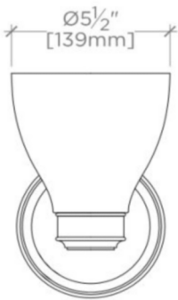
FRONT VIEW SCALE: 2"=1'-0"