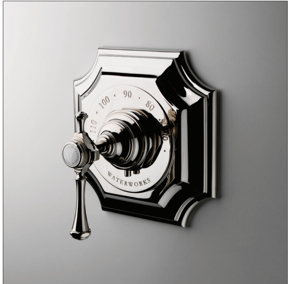
SHOWN IN Nickel

The manufacturing process encompasses casting, turning, forging, hand-fitting and hand polishing.