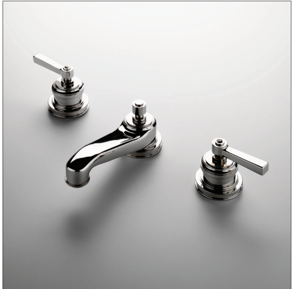
SHOWN IN Nickel

Complies with 0.25% Weighted Average Lead Content (WALC).