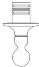
TOP VIEW SCALE: 3"=1'-0"