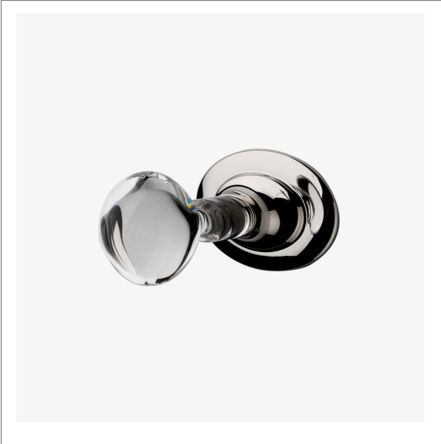
SHOWN IN OPUS VOLUME CONTROL VALVE TRIM WITH CRYSTAL EGG HANDLE| OPVC38