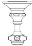
TOP VIEW SCALE: 3"=1'-0"