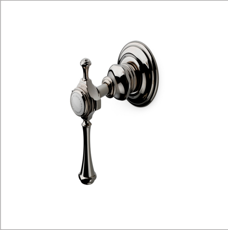
SHOWN IN NICKEL WITH LEVER HANDLE