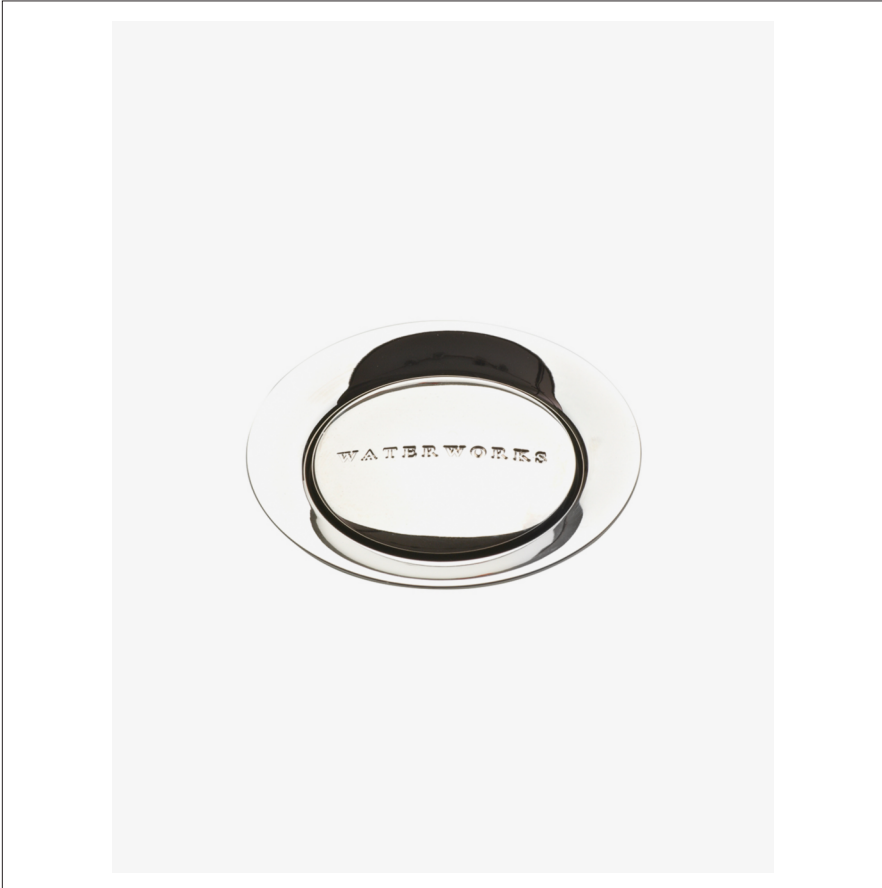
SHOWN IN UNIVERSAL USA POP-UP LAVATORY DRAIN| UNLD07