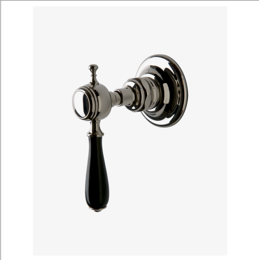
SHOWN IN JULIA VOLUME CONTROL VALVE TRIM WITH BLACK PORCELAIN LEVER HANDLE | JUVC52