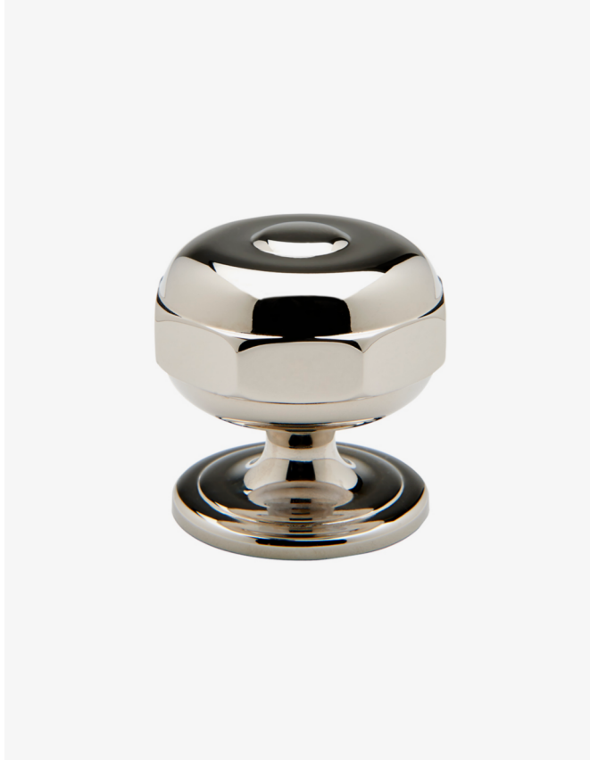
SHOWN IN CAMDEN 1 1/2" KNOB | CAHW02