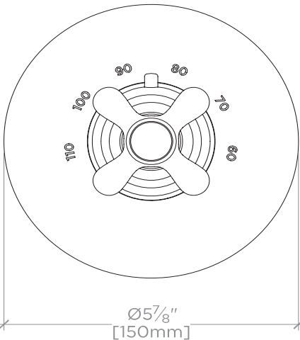
FRONT VIEW SCALE: 3"=1'-0"