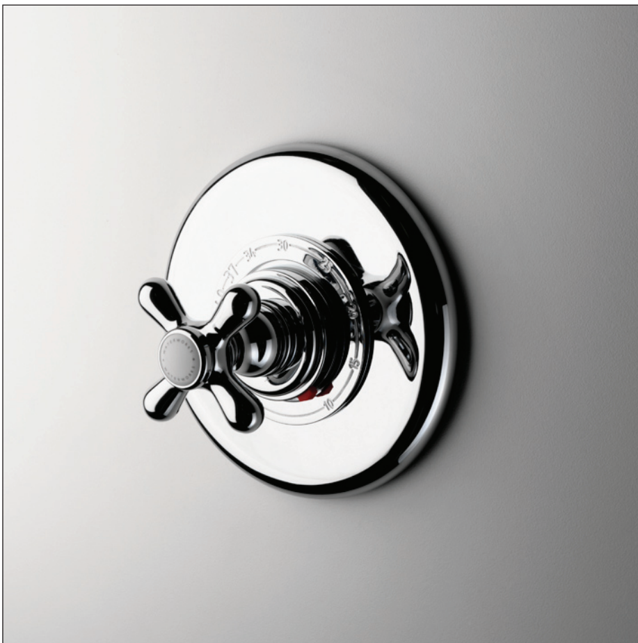
SHOWN IN Chrome

The smooth, sculptural contours and simplified linear detail ensure that Elsa will be comfortable and welcomed in any bathroom.